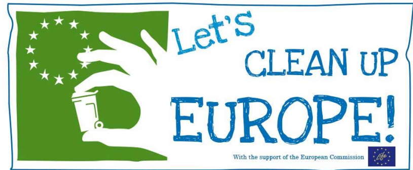
Facebook cover image