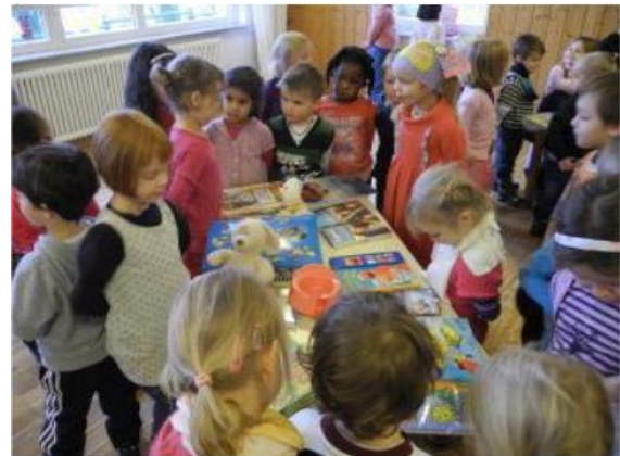
Left: Give Box – 2012 – Belgium, right: Swap Event with children – 2012 – Germany