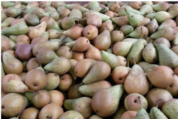
Poires fraîches en vrac