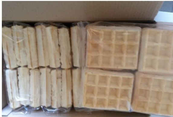
Gaufres de Bxl mini surgelée